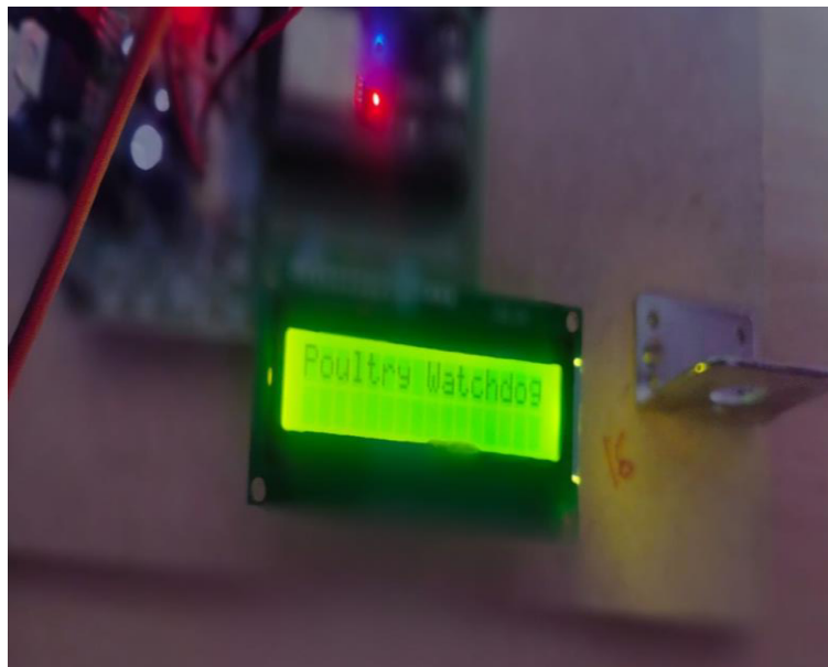
Figure.2: Lcd Screen Displayed